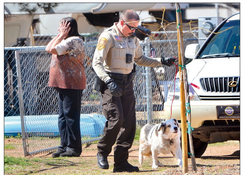
Yavapai County sheriff's deputies remained at the site of Monday's alleged shooting throughout the night and into the day Tuesday to handle the follow-up investigation.