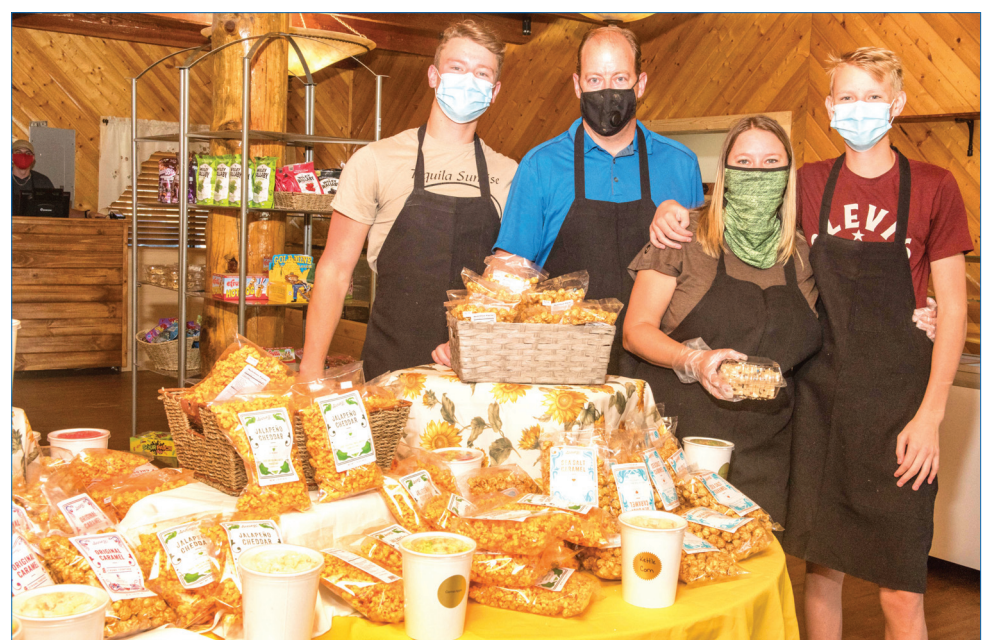
The biggest seller at the Grand Canyon Chocolate Factory is the Grand Canyon Crunch, a crispy treat perfect for traveling. Grand Canyon Chocolate Factory is located in Tusayan.

"We have 24 gelato flavors," Vikki said.