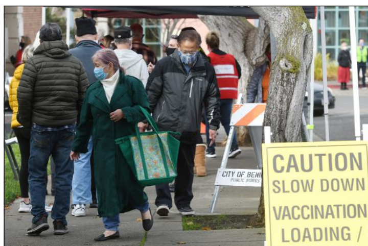
Hundreds of seniors wait in line to receive the COVID-19 vaccine in Benicia on Tuesday.