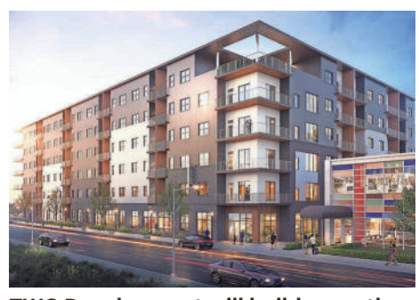
TWG Development will build more than 150 apartments along the Red Line at 1827 N. Meridian St.