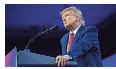
Former President Donald Trump.