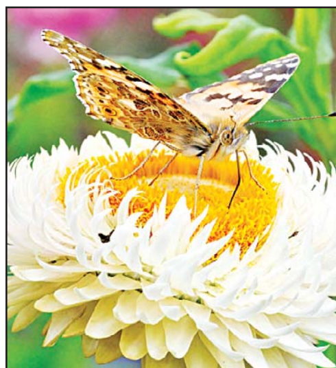
A butterfly feeding on a flower.