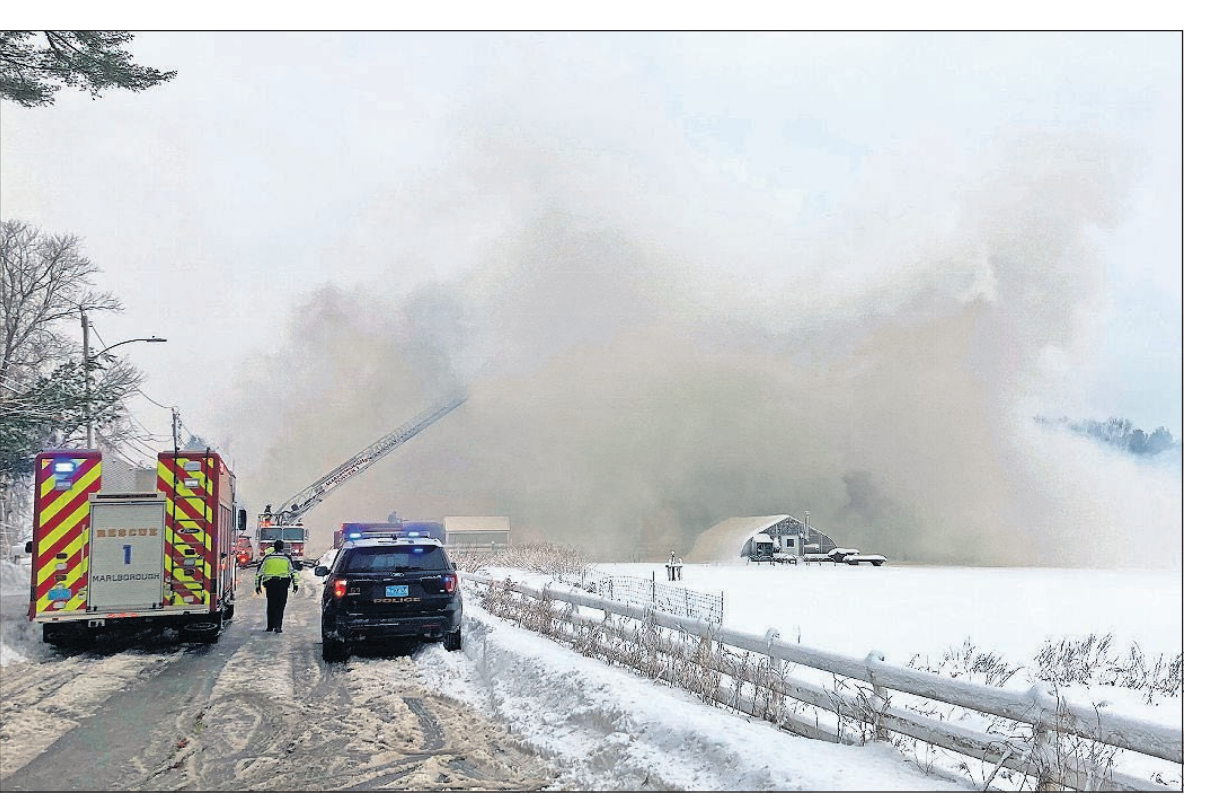
Much of the barn has already collapsed.