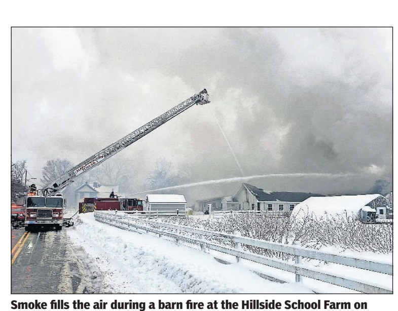
Robin Hill Street in Marlboro, Feb. 2, 2021. Much of the barn has already collapsed.