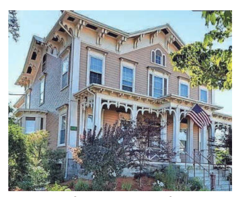
YWCA Southeastern Massachusetts has purchased its third house at 549 County St., as part of its Residential Services program.