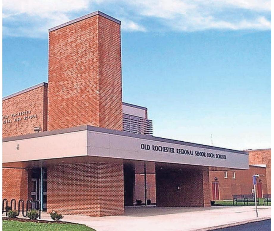
Old Rochester Regional School District officials have voted to approve 10 school library books that have been a source of lingering controversy and contentious public discourse in the district since the fall.