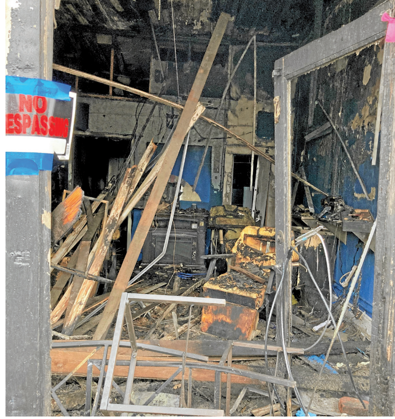
SUSIE C. SPEAR, ROCKINGHAMNOW

Farmer asks that anyone with information concerning the fire