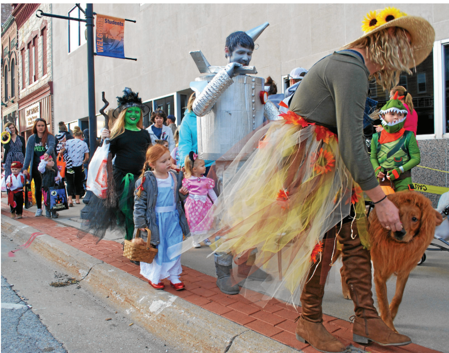
COLLIN SPILINEK, FREMONT TRIBUNE

CLOUDY WITH SHOWER 51 • 36 FORECAST, A3 | TUESDAY, OCTOBER 20, 2020 | fremonttribune.com