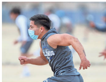
The Las Cruces football team practice in "pods" or small groups at Las Cruces High School on Tuesday, Jan. 19, 2020.

The pandemic has presented the first-term Democrat with three major challenges: managing a continuing public health emergency that is now in its 11th month; a severe economic downturn resulting from restrictions on travel and business activity aiming to slow community spread of the disease; and political pushback not only from Republicans but from local law enforcement agencies and elected sheriffs on enforcing some of the earliest and more strict